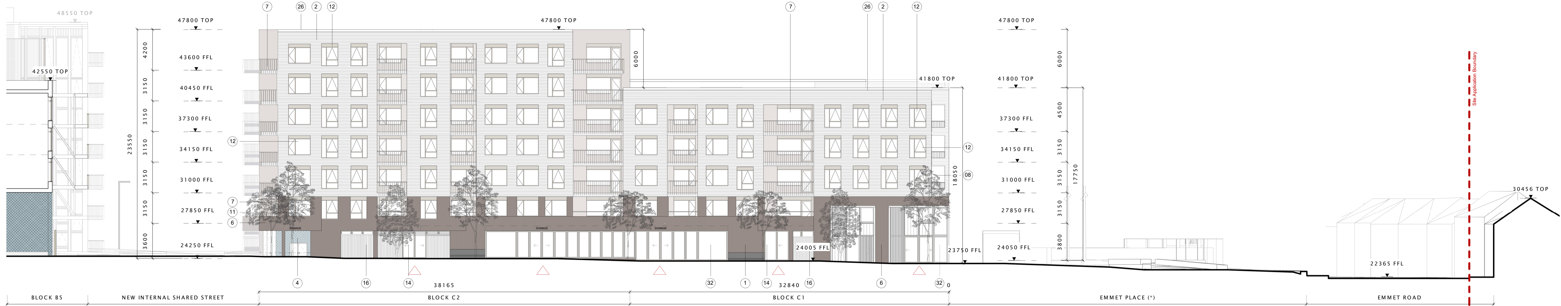
03 BLOCK C - Commercial mixed use Elevation (New internal street) 1:200