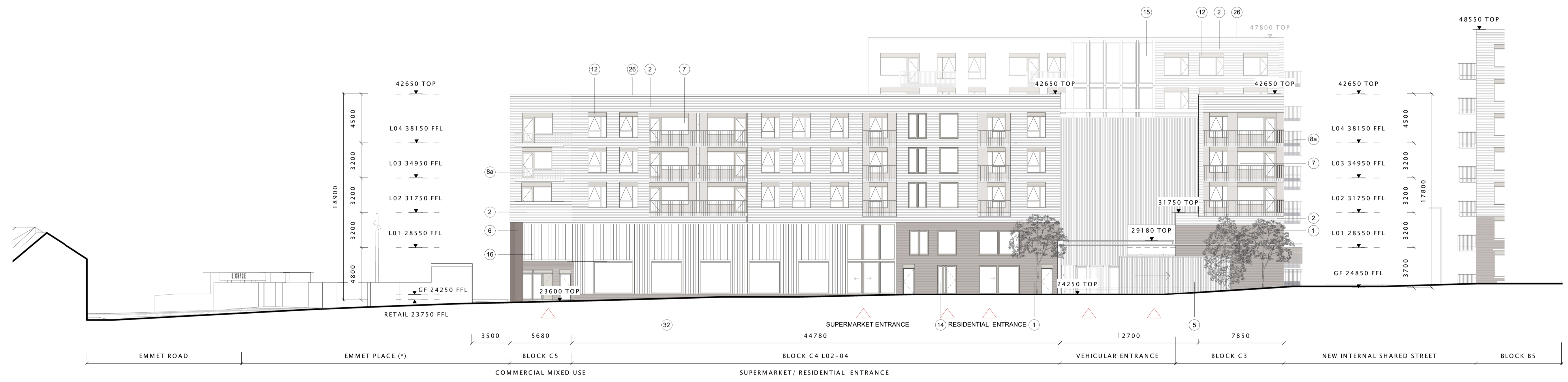
04 BLOCK C - Commercial mixed use Elevation St Vincent Street West 1:200